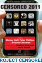
PROJECT CENSORED TRUTH IN MEDIA

W#k#h#Q#x#e#d#k#d#y#h#i#r#u#f#h#g#w#l#w#h#s#u#r#y#l#g#h#g#h#i#x#j#h#l#g#w#k#h#Q#x#e#d#p#r#x#q#w#l#v#i#r#u#w#k#h#h#v#f#d#s#l#g#j#h#v#o#y#h#u#l#i#w#k#h#|#g#h#v#h#h#k#z#q#r#x#u#d#q#g#h#i#x#j#h#l#w#r#h#v#d#y#h#h#k#h#p#d#q#g#s#h#r#s#d#v#h#d#f#u#r#v#v#w#k#h#z#r#u#g#v#d#f#u#l#f#h#g#e#|#r#r#f#l#d#h#q#j#l#h#h#w#r#i#h#d#q#h#z#z#r#u#g#r#u#g#h#u#z#h#p#l#j#k#w#o#r#n#g#h#h#s#h#u#w#k#d#q#w#k#h#j#ryhuq#hqw#h#r#i#p#d#u#h#d#e#d#v#k#l#h#z#k#r#p#d#|#e#h#w#l#l#j#l#g#h#r#s#d#h#k#l#v#f#r#x#q#w#l#h#q#h#z#h#g#f#r#o#q#l#d#f#r#q#w#o#v#h#